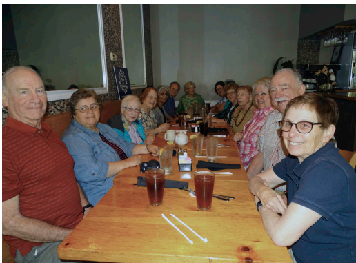
Lunch Bunch at Hickory Ridge Grill on June 15th.

Besides Membership and Volunteers, we have a Program Committee to organize the many events we hold and come up with new ideas for future months. We have a Financial Committee, that includes the Treasurer so we can track our financial health. The Fundraising Committee is responsible for such events as the recent Appraisal Road Show on June 18th which was once again a financial success and an entertaining evening for all. All of this would not be possible without our IT Committee to keep the website up to date and the Calendar postings functioning. They are there to step in and solve those computer problems which seem to be part of life in the 21st century. The Marketing Committee gives presentations to groups and looks for ways to keep TVIH a presence in the Howard County Community. If any of these different committee functions interest you and you would like to be part of them, just email 4info@thevillageinhoward.org to help keep the Village an integral part of life here in Howard County.