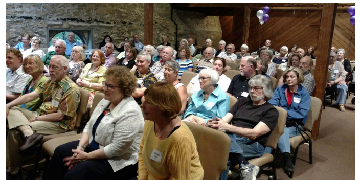
Appraisal Road Show on June 18th at Oliver's Carriage House.

Besides Membership and Volunteers, we have a Program Committee to organize the many events we hold and come up with new ideas for future months. We have a Financial Committee, that includes the Treasurer so we can track our financial health. The Fundraising Committee is responsible for such events as the recent Appraisal Road Show on June 18th which was once again a financial success and an entertaining evening for all. All of this would not be possible without our IT Committee to keep the website up to date and the Calendar postings functioning. They are there to step in and solve those computer problems which seem to be part of life in the 21st century. The Marketing Committee gives presentations to groups and looks for ways to keep TVIH a presence in the Howard County Community. If any of these different committee functions interest you and you would like to be part of them, just email 4info@thevillageinhoward.org to help keep the Village an integral part of life here in Howard County.